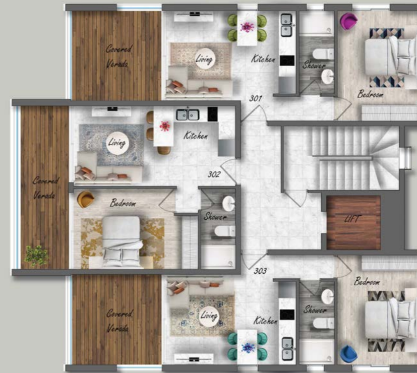
First - Third Floor